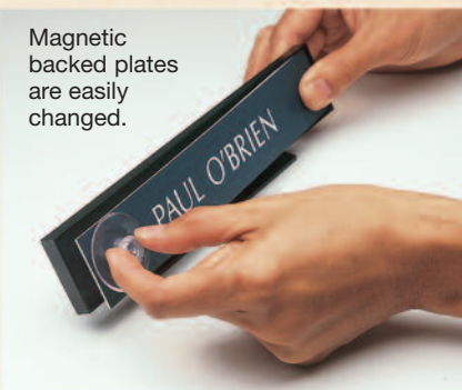
Magnetic backed plates are easily changed.