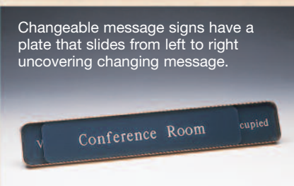
Changeable message signs have a plate that slides from left to right uncovering changing message.