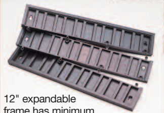
12" expandable frame has minimum size of 3 7/8" x 11 7/8". 2" center sections can be added to expand to desired height by a 11 7/8" width.

Designer 2 has keyhole mounting, or pin hangers for mounting to fabric covered partitions.