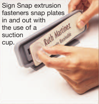
Sign Snap extrusion fasteners snap plates in and out with the use of a suction cup.

Frame dividers section off frames for multiple plates. Must be glued or taped in.