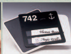
Acrylic lenses are laser cut and snap into frames featuring paper graphics.