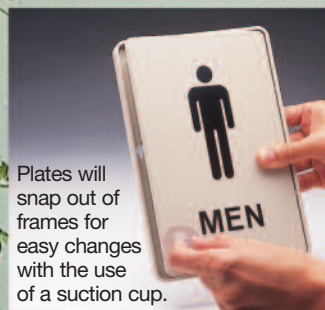
Plates will snap out of frames for easy changes with the use of a suction cup.