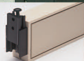
A black anodized aluminum bracket with concealed screws is used to mount double sided frames.